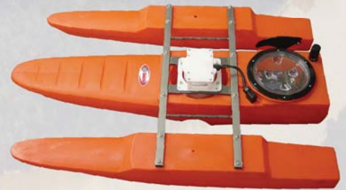
Trimaran with ADCP & integrated radios