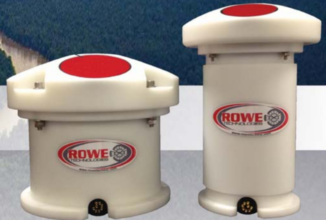
300Kz / 600kHz

Rowe Technologies, Inc. provides flexible solutions ranging from the ADCP (for over-the-side applications) as well as an ADCP and trimaran (with integrated radios), and a completed solution for complex sites (ADCP, trimaran with radios, and DGPS). For large river mouths that exceed the trimaran limitations, a USV equipped with an ADCP provides autonomous access. Our DP-Pro software is easy to use and incorporates multiple languages with more languages added at user request. If you want to measure flow accurately and reliably, Rowe Technologies, Inc. has the solution for you.