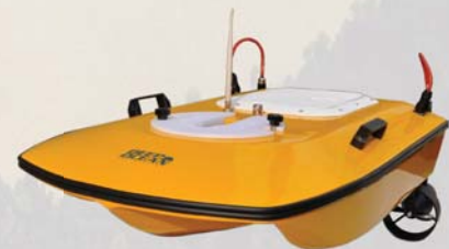
USV with ADCP